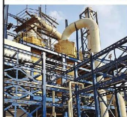
Calcium Chloride Plant, Abu Dhabi